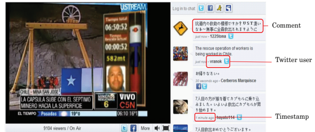
Figure 1: The snapshot of a Ustream live broadcast.

Inspired by the idea of “the wisdom of crowds” [6], we realize that if multi-viewers can annotate the videos just like what ESP