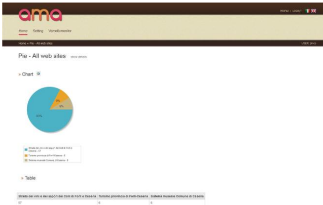
Figure 1 – An AMaRi screenshot, with a pie chart and the corresponding table.