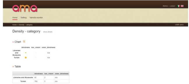
Figure 2 – An AMaRi screenshot, with a density chart and the corresponding table.

AMaRi has been designed and implemented to support authors/editors involved in the implementation and assessment of accessible Web sites. It provides a feasible and accessible system to exploit a huge amount of data resulting by accessibility evaluations and monitoring activities. Its interface lets the users create their own points of view about gathered data.