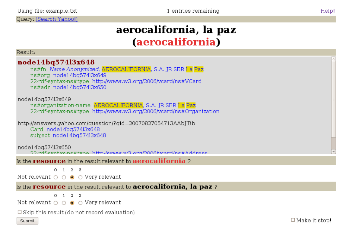
Figure 3: A screen capture of our evaluation tool showing a query for the entity "Aerocalifornia" with context entity "La Paz".