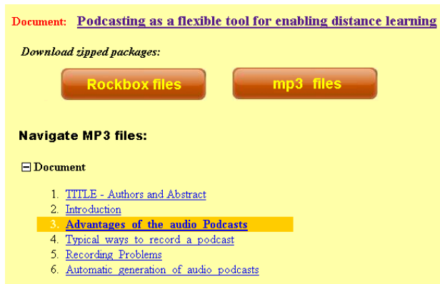
Figure 3. Web system interface: podcast download

The Podcast list (Fig. 3) corresponds to a content table of the submitted document. This list allows the user to quickly understand the structure and topics of the document without having already read (or listened to) it. In our system, screen reader users can easily explore a podcast list on the web interface by jumping on the corresponding WAI-ARIA region [12]. In order to improve usability via screen reader (limiting the number of links), if the algorithm generates a high number of podcasts, only one link pointing to the whole list is inserted in the page.