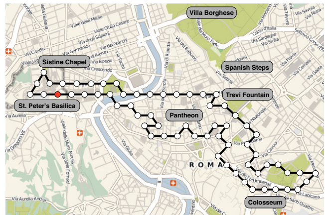
Map copyrighted by OpenStreetMap (and) contributors, CC-BY-SA

where, \tau_j is the quantity of pheromone left on the node v_j , p_j is the profit gained by visiting v_j and \mathcal{N}(v_i) is the direct-neighborhood of node v_i . The values \alpha and \beta are tuning parameters of the algorithm that balance the influence of the profit value and the “memory” of previous random-walks that have visited the target node. Each ant explores the graph, starting from node S , visiting nodes and collecting profits. At each stage we also check whether we can reach S from the current node without violating the distance constraint. Whenever we break the constraint, the ants backtrack and reach S via an optimal backward path computed using dynamic programming (which can be carried out efficiently on the grid graph), thus completing the tour. At the end of each round, when all ants have completed their tour construction, pheromone values on the visited nodes are updated so that the nodes in the best tour are biased to be visited in next rounds. We omit the details of the pheromone update models we have used due to lack of space.