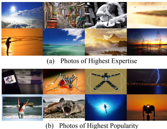
Figure 2. Retrieved Photos with the highest expertise and with the highest popularity.

Figure 2 demonstrates some high-ranked photos on expertise and popularity searched by the proposed scheme. In each figure 2-(a) and 2-(b), upper four pictures are results of no search keyword, and lower four are results of search keyword "sea". Photos of expertise appear to be quite relevant to high-level skills on photography; meanwhile, popular photos seem to be related to interestingness of stuff such as young woman, unusual situation, rare animals, and so on.